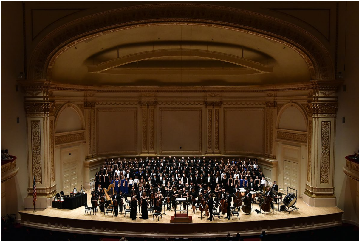
Performers take the stage in Carnegie Hall