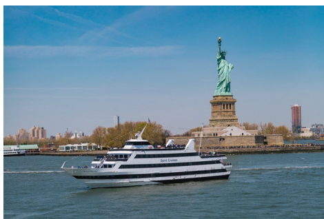
The Spirit of New York at the Statue of Liberty