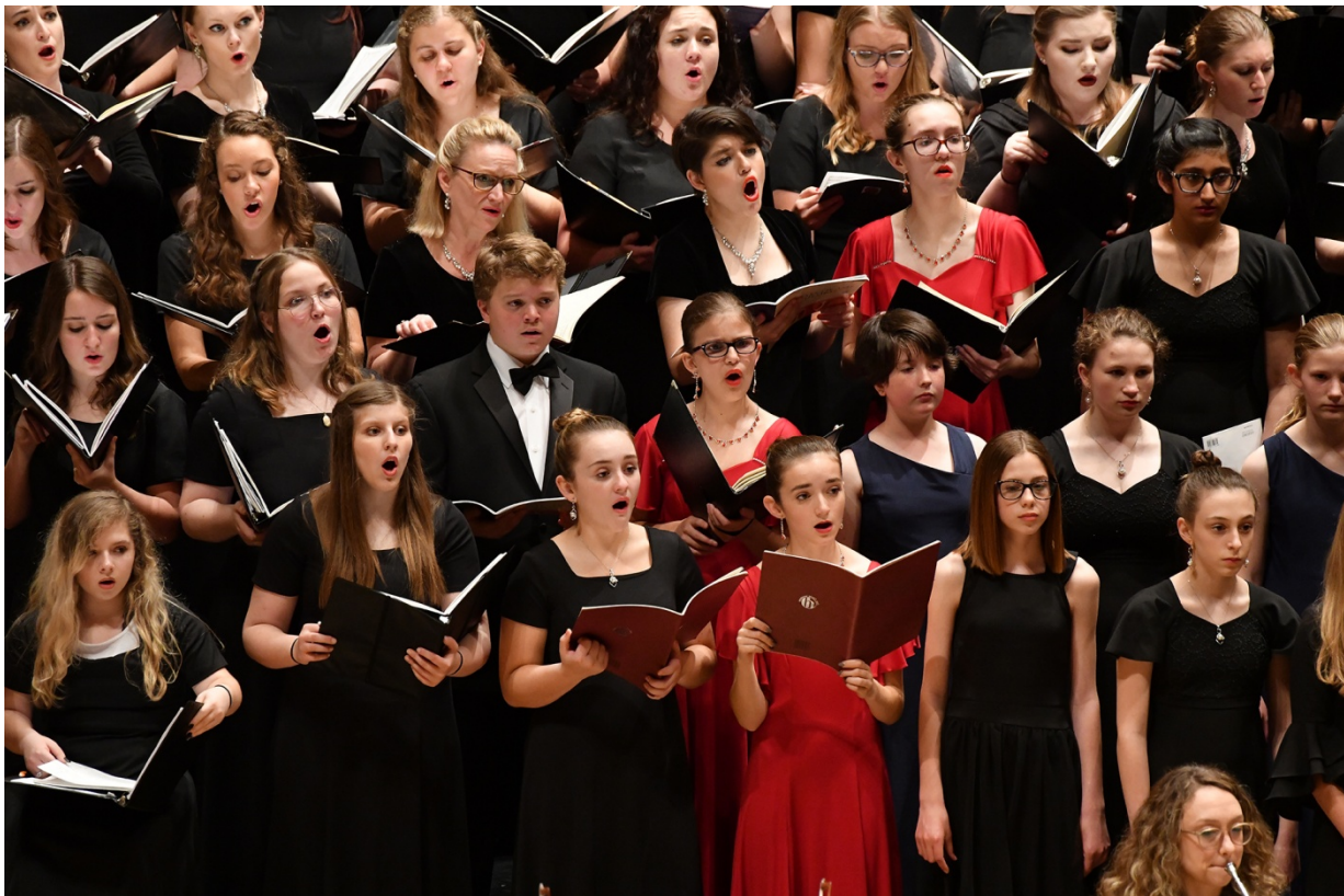
Choristers sing Mass of the Children at Carnegie Hall under the direction of Maestro John Rutter