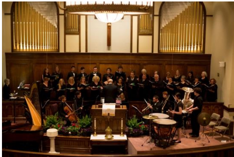
Sacred Choral Concert The Willow Oak Chorale April 26, 2014 First United Methodist Church, Springfield