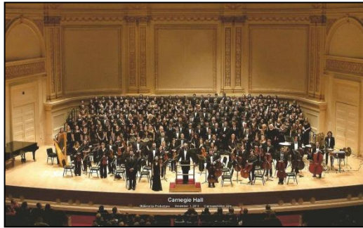
The Willow Oak Chorale Carnegie Hall, New York City December 1, 2013